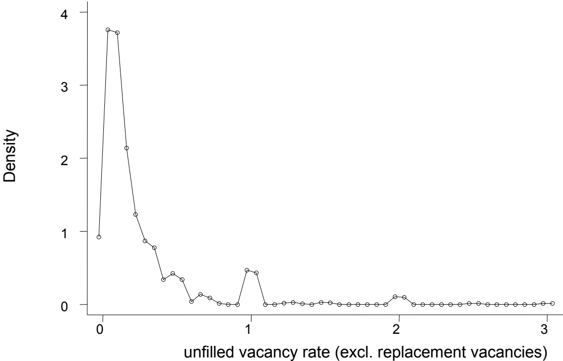
Figure 1: Distribution of the adjusted vacancy rate (univariate kernel density estimation)